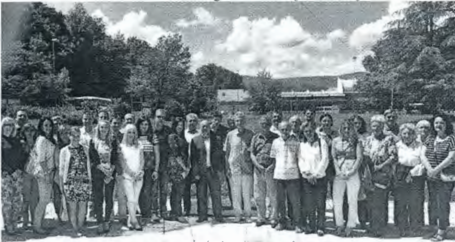
Photos from training held in Vrnjačka Banja

On this occasion, both teaching and non-teaching staff of HBSL were familiarized with the higher education system of EU and the experience of EU countries in relation to pedagogical trainings and modernization of the teaching process. Moreover, they learned about distance learning, Moodle software package and use of office software in modern education and business. HBSL staff also learned about the modern tendencies in the organization of teaching in higher education.